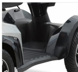
Plenty of foot room